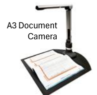
A3 Document Camera