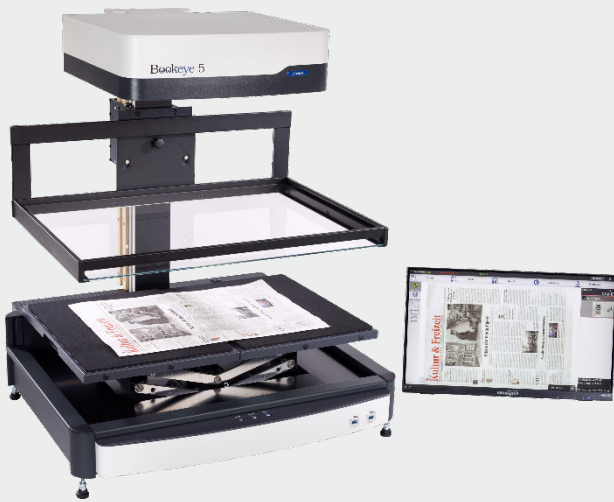
Scanning newspapers up to A2 with flat glass plate.

The book cradle enables perfect scans while protecting the book binding. The V-shaped glass plate can be removed in a few simple steps. Depending on requirements, the Bookeye® 5 V2 Archive can now be used with an optional flat glass plate or without a glass plate at all.