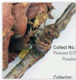
The ObjectScan 1600 Scanner

ObjectScan 1600 has a color linear CCD with resolution up to 1,600 pixels per inch, equaling that of 1Gigabyte. With the built-in 48-bit ADC (Analog to Digital Converter), the whole specimen as well as details of surface textures can be precisely captured and presented in high fidelity format.