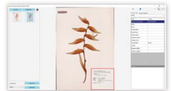
Image archive and privileged account management system

Specimen label information will be recognized and automatically saved titled by herbarium code and specimen serial number in XML format through ScanWizard-Botany. Various options, such as contrast, lightness, and sharpness, are also provided for curators on image adjustment.